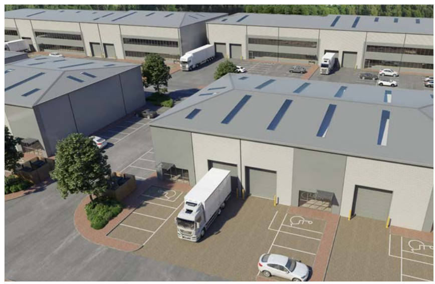
Helix, Solstice Park