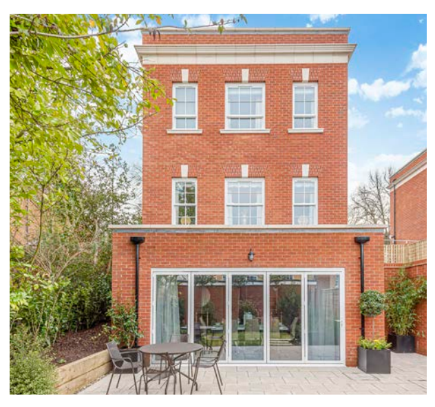
Burlington Place, Winchester

Established in 2020 to build on the group's existing successes in land acquisition and planning